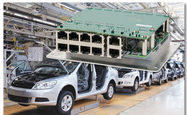
10 port managed Open Frame Switch