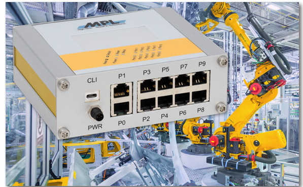
10 port managed Switch with DIN-Rail housing

All MPL products are 100% designed and manufactured in Switzerland.