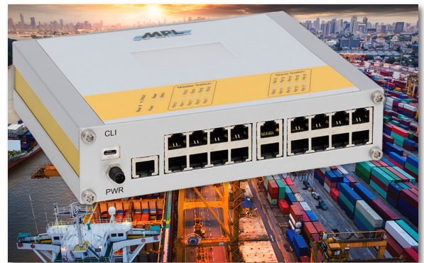
19 port managed Switch with DIN-Rail housing