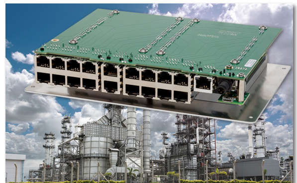
19 port managed Open Frame Switch