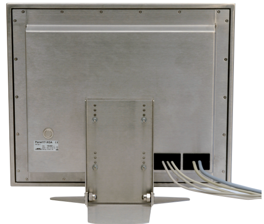
PANEL19 view from back