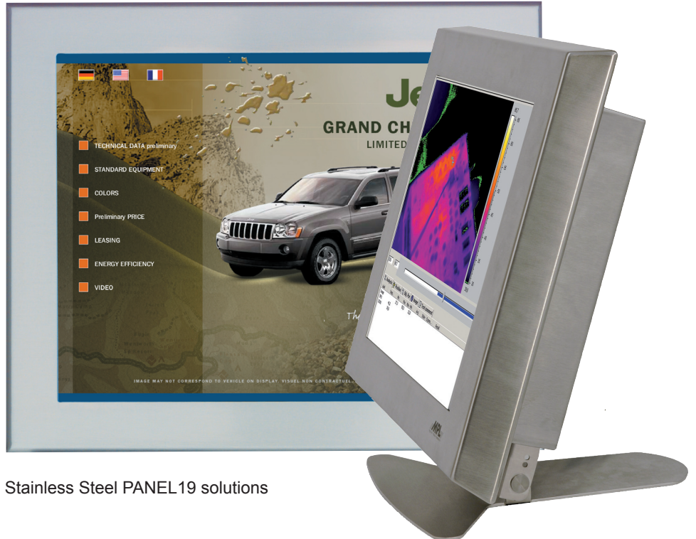
Stainless Steel PANEL19 solutions

The robust and all around IP65 protected PANEL19 is the perfect solution as man machine / front end interface for harsh applications like in transportation, maritime or for clean environments like in medicine, food industry. Further as space saving, IP54 protected, fanless and noiseless system the PANEL19 is an excellent solution for desktop applications in telecommunication, kiosk information systems and Internet access points where a quality product is an issue.