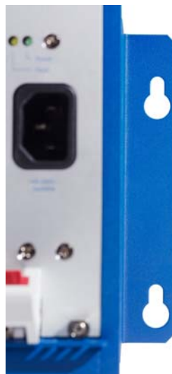
Wall Mount Option