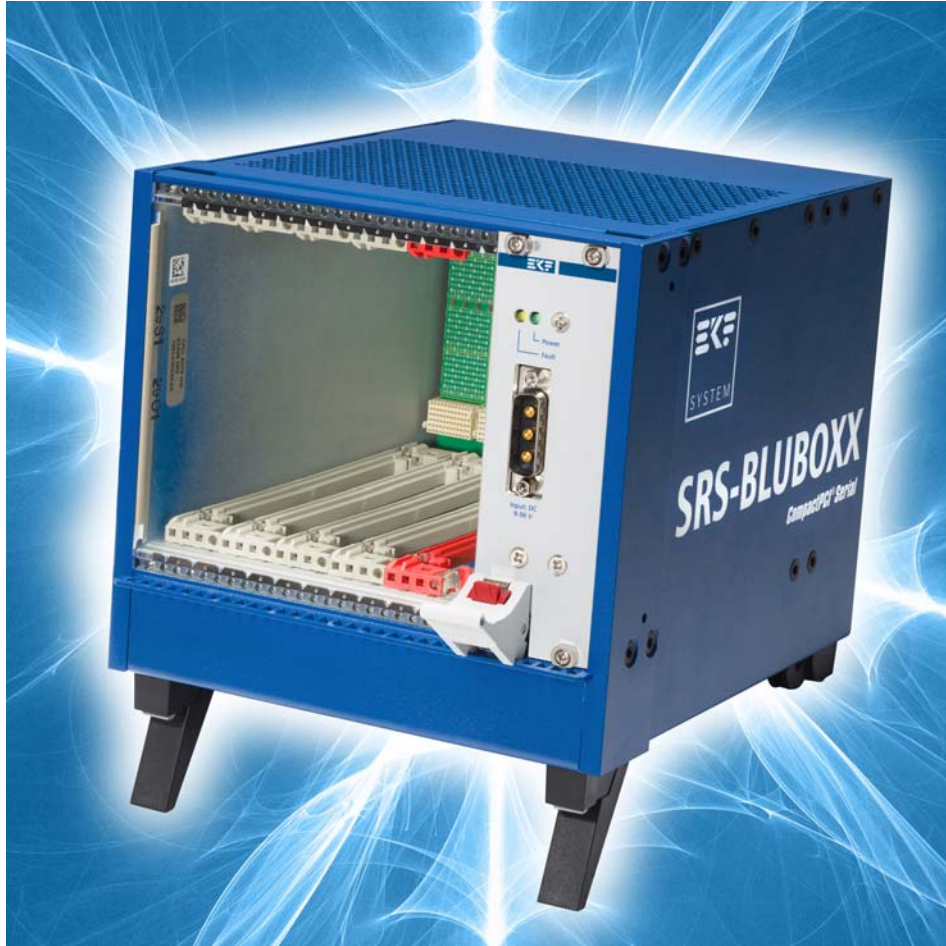
SRS-BLUBOXX w. DC Power Supply