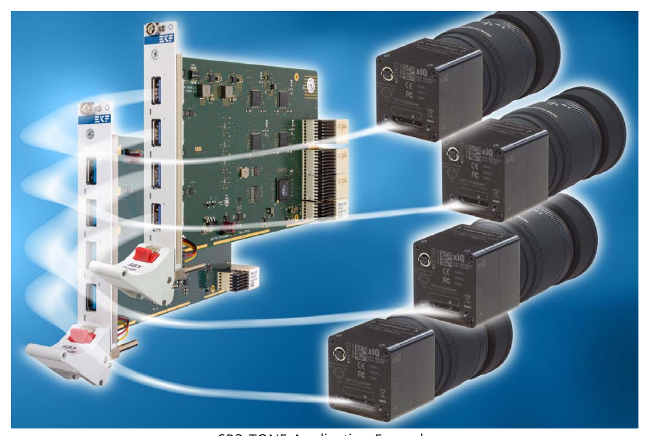
SB3-TONE Application Example

The SB3-TONE is based on PCI Express® technology. For optimum performance the board requires a 5Gbps PCI Express® Gen2 sourced backplane slot. The TUSB7340 contains a single xHCI controller combined with a quad port USB 3.0/2.0 hub, hence a PCIe x 1 peripheral slot is sufficient for operation.