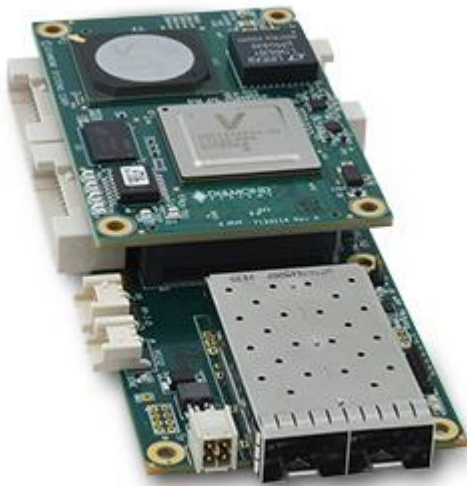
EPS-12002L switch end view, cooling solution removed