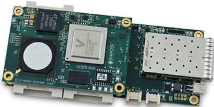
EPS-12002L switch with cooling solution removed to show detail