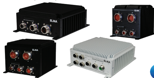
NetSys 5300 Family