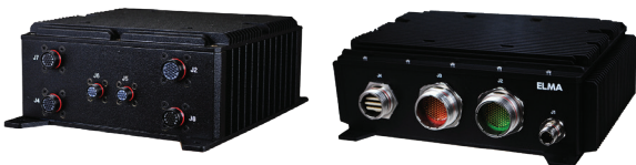
ComSys 5300 Family