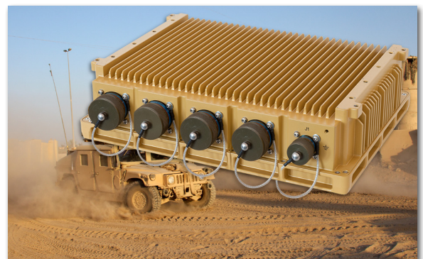
MIL Version of the 8-port switch