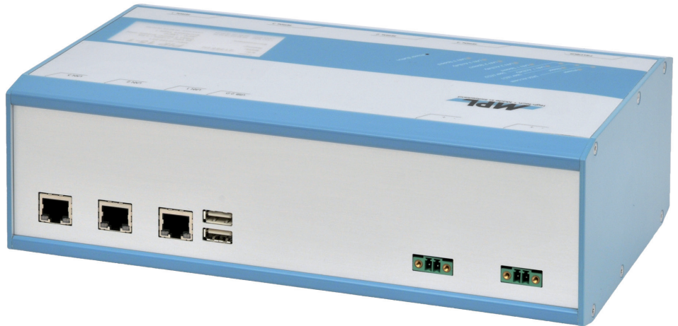
PIP15 in rugged aluminum housing

The PIP15 represents a unique solution for today's industrial needs with no graphic output requirement. It is available with various options and features. The PIP15 is designed to work without the need of fans and without derating or throttling. The special engineering results in an unique solution that is compact, maintenance free, noiseless and reliable. All MPL PIP solutions can be assembled according to your needs.