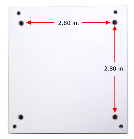
Aurora's aluminum thermal dissipation heatspreader with standardized mounting hole pattern